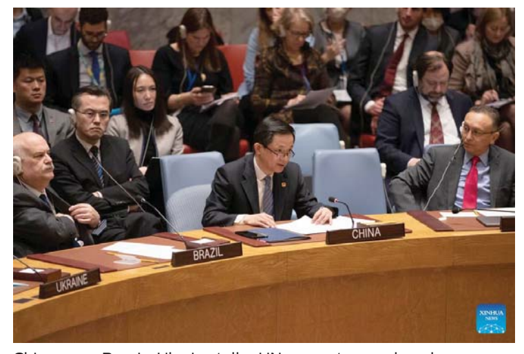
China urges Russia-Ukraine talks, UN supports no nukes clause

jointly oppose armed attacks against law is a code of conduct that must be nuclear power plants or other peaceful nuclear facilities, ensure strict compliance with the Convention on Nuclear Safety, among others, and support the International Atomic Energy Agency (IAEA) in playing a constructive role in promoting the safety and security of peaceful nuclear facilities, he added.