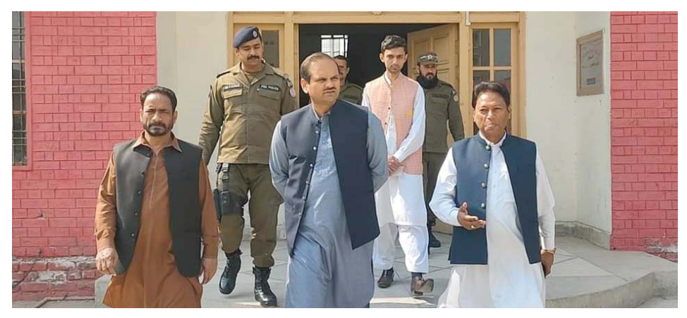
schools are not available. The ty Commissioner said that all the problems faced by the education- al institutions will be solved on priority basis.

Appreciating the efforts of the school administration, the Depu-