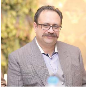
of Sopur was first kept in Bara Mullah Jail, then he was transferred to Haryana