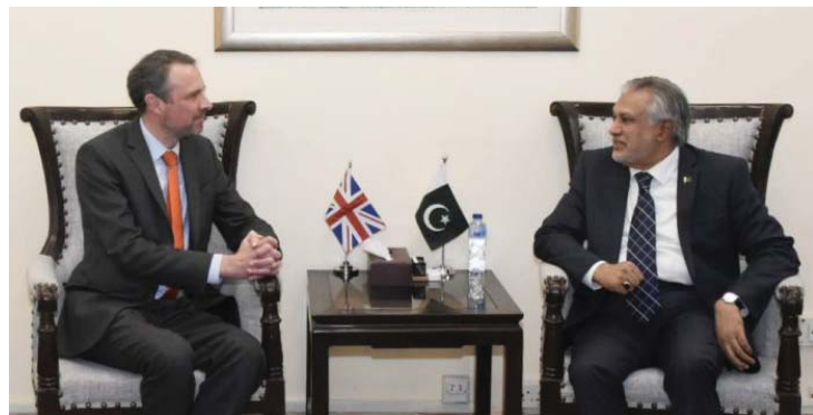
Islamabad: British Acting High Commissioner, Andrew Dalgleish during a call on meeting with Federal Minister for Finance and Revenue Senator Mohammad Ishaq Dar at Finance Division.

They exchanged views on matters of common interest including promoting mutual trade and investment between the two countries, the state-