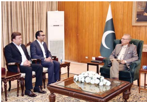
of Pakistan and Afghanistan Siemens Healthineers,

The President expressed these views while talking to Chief Executive Officer