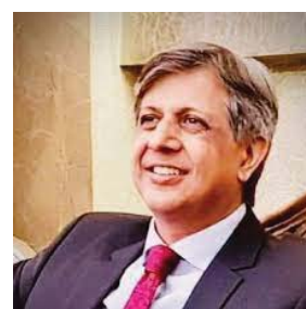
ties are guarded against."

Article 218 (3) reads: "It shall be the duty of the Election Commission to organize and conduct the election and to make such arrangements as are necessary to ensure that the election is conducted honestly, justly, fairly and in accordance with law, and that corrupt prac-