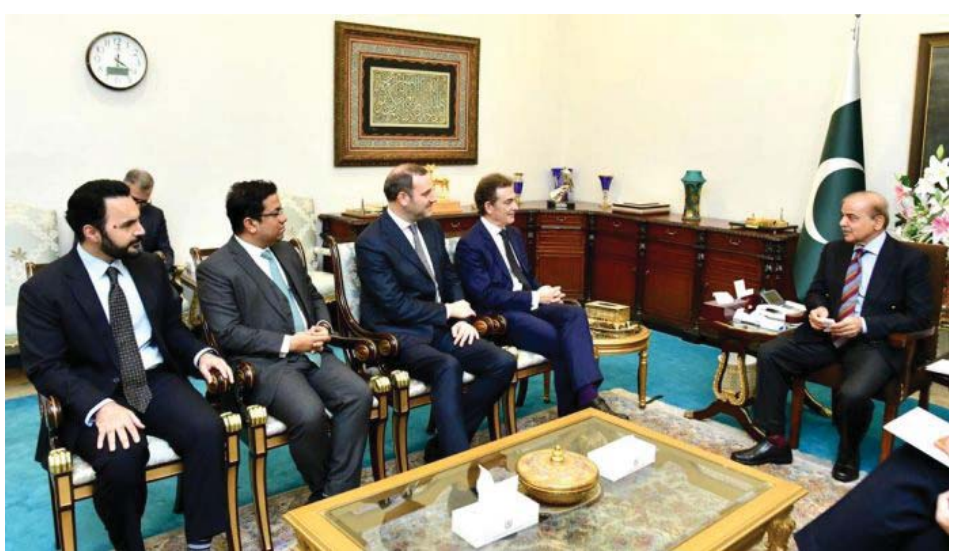
that called on him, PM Office Media Wing said in a press release. The meeting was attended by Minister of State for Finance Dr Ayesha Ghous Pasha and

Spokesman Report ISLAMABAD: Prime Minister Muhammad Shehbaz Sharif on Monday said that the government was taking tangible and necessary steps to strengthen the economy and prioritizing reduction in unnecessary imports by enhancing exports. The prime minister said that the incumbent government also faced the issues of mismanagement of the previous government, adding still in the face of such issues, the government was committed to improving the country's economy with strenuous efforts. The prime minister was talking to a delegation of Rothschild and Co, one of the world's largest independent financial advisory groups,