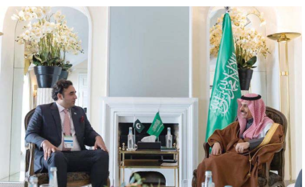
He also met with Foreign and they expressed determi-

The minister met with Vice President and Foreign Minister of Jordan Ayman Al Safadi and they agreed to expand bilateral ties and high level contacts between Pakistan and