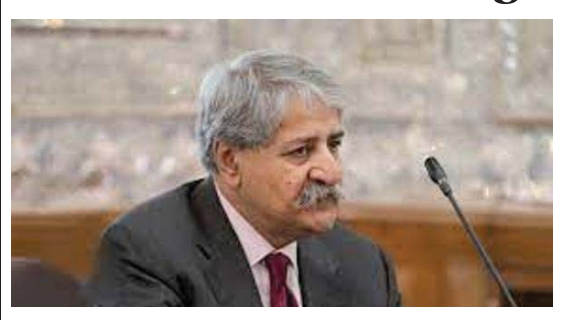
B News Desk

ISLAMABAD: Minister for Commerce Syed Naveed Qamar will attend the meeting of Trade and Investment Framework Agreements (TIFAs) which would be held at Washington.