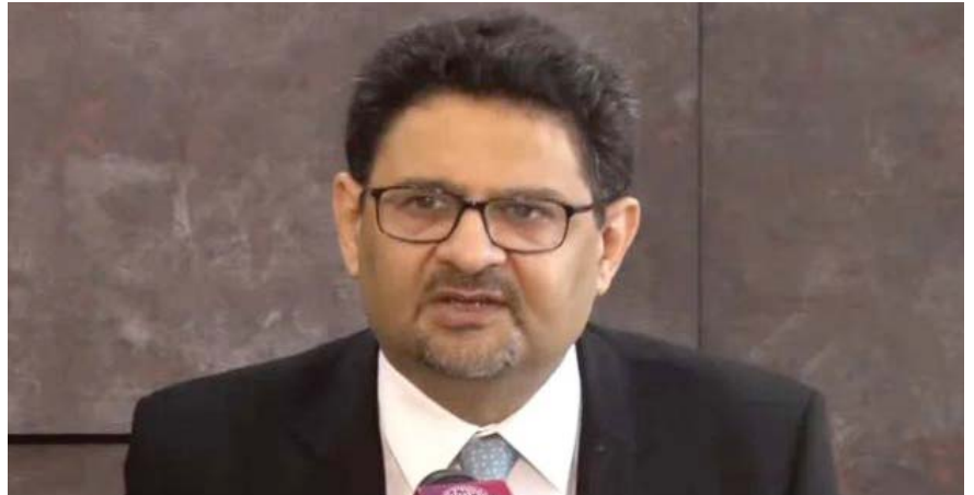
The PML-N leader said that the friendly countries also assured IMF that they would invest in Pakistan, but later they all stepped this program ends.

ment is now realizing that the situation would have been different if the finance ministry followed his policy.