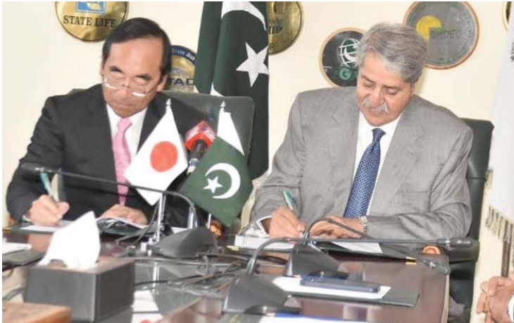
At the occasion, Federal Minister Syed Naveed Qamar emphasized that