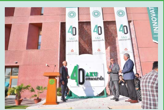
40th anniversary identity at a live event broadcast to AKU campuses globally.

A large number of university students participated and interacted with the speakers of the seminar during the question answer session. At the end of the seminar commemorating shields were presented to guests of the seminar.