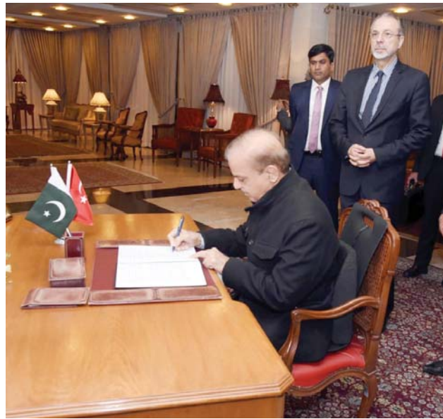
was being provided on the basis of daily reports from the Ministry of Foreign Affairs and Pakistan's ambassador to Turkey.

The PM said brothers in Turkey were sent assistance through air, sea and road while the government was also considering to send aid through trains. He informed that assistance