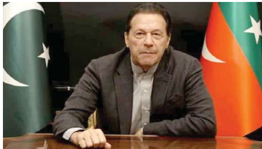
religious scholar, but I have travelled the world as a result of my cricketing career."

Saying the country gained independence in the name of Islam, Mr Khan said, "What led to the European countries sweeping past the Islamic countries?" Mr Khan went on to say, "I am not a