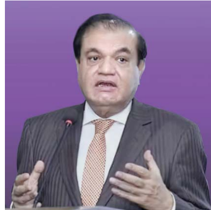
territory which has become a big problem for us.

Contrary to our expectations, instead of increased relations with the neighboring country, there was an increase in attacks from its