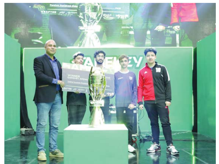
for gaming enthusiasts from across the country.

GameKey Arena was the inaugural tournament on GameKey platform, however, PTCL and Ufone 4G intend to transform it into a calendar event, making it an annual gaming festival