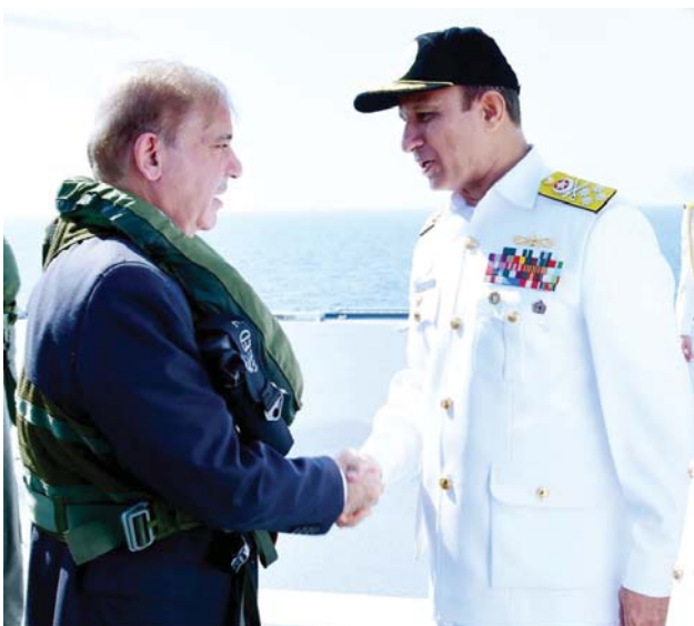
ing to a press release.

The culmination ceremony marked a powerful conduct of International Fleet Review (IFR) followed by spectacular forming up of AMAN Formation comprising Pakistan Navy and foreign naval ships, accord-