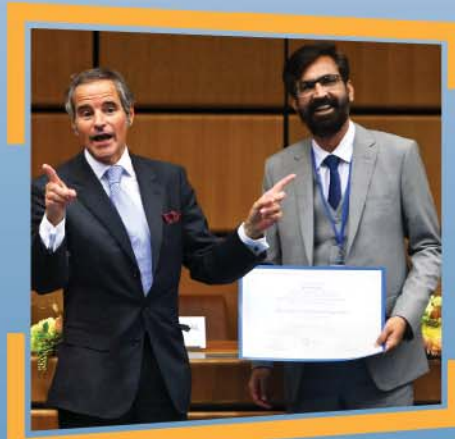
Young PAEC Agriculture Scientist Awardee with DG IAEA