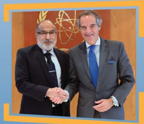
Chairman PAEC with DG IAEA