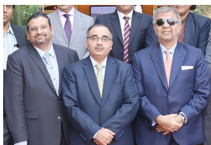
and LCCI to share research work and schedule consultative sessions.

A meeting was planned in next month between representatives of ICAP, PIPFA