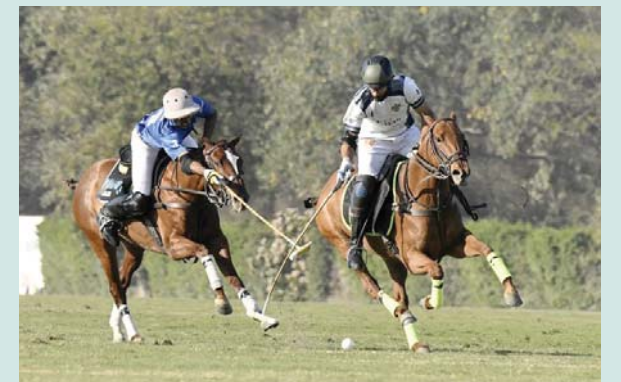
LAHORE: A view of the final Polo match between FG Polo and Master Paints during Century 99 Punjab cup at Polo club.

At the conclusion of the 4th Hi Tech Couples and Ladies Golf Championship the prizes were