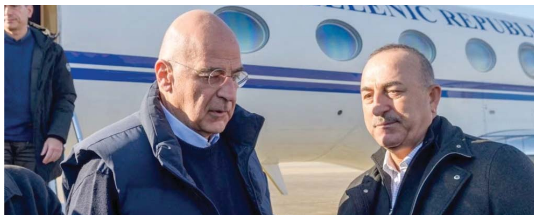
Greek Foreign Minister Nikos Dendias is welcomed by his Turkish counterpart Mevlut Cavusoglu.

"This is showing the solidarity of Greek people with Turkey and the Turkish population. Greece was one of the first countries to call and propose help