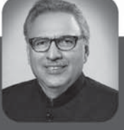
Dr Arif Alvi President, Islamic Republic of Pakistan

#KashmirSolidarityDay #PakistanStandswithKashmir