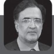
Qamar Zaman Kaira Adviser to the Prime Minister on Kashmir Affairs and Gilgit Baltistan