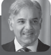
Muhammad Shehbaz Sharif Prime Minister, Islamic Republic of Pakistan