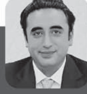
Bilawal Bhutto Zardari Foreign Minister, Islamic Republic of Pakistan