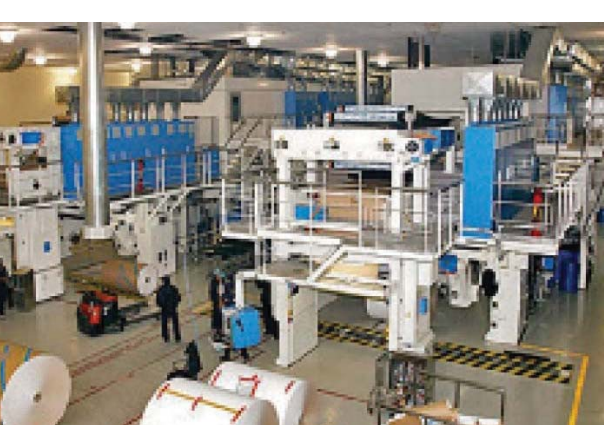
Faad Waheed, Senior Vice President ICCI said that the economic activity has already come to a standstill with

ceutical, cooking oil & ghee, automobile, poultry, light engineering, chemicals & plastics have to import inputs and raw materials for their manufacturing and assembling activities, but import consignments of many industries are help up at ports due to shortage of foreign exchange and many industries are unable to import the required inputs and raw materials due to which they are facing closure of their manufacturing activities. He emphasized that the government should immediately start consultation with the private sector including the major chambers of commerce and industry to evolve a new strategy in order to steer the economy out of the current challenges.