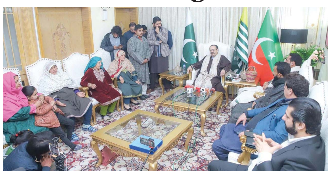
rock against India despite facing multi-

The visiting delegates on the occasion presented Kashmiri Shawl, Pheran (Kashmiri cloak) and Kangri (Fireport) as a gift to the Prime Minister. The Prime Minister on the occasion praised Kashmiris' resilience in times of repression and said, "We are proud of our brethren in IoK who stand like a ple challenges".