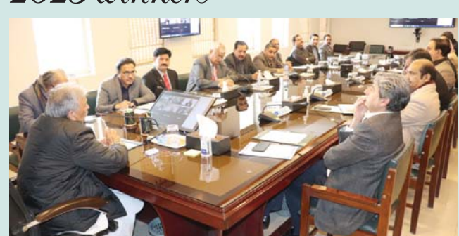
Example 2 City Reporter

ISLAMABAD: The Federal Directorate of Education, Ministry of Federation and Professional Training in partnership with STEAM Pakistan organized a multi-level STEAM Competition for FDE schools across Islamabad, culminating in a celebration for winners and top performing schools yesterday.