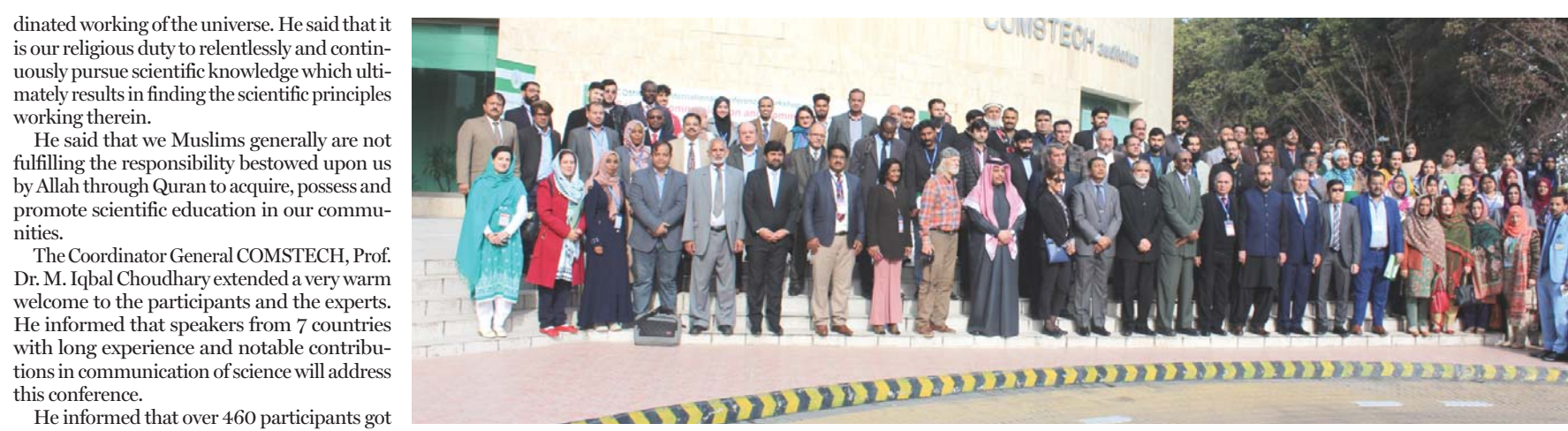
COMSTECH International Conference/Workshop on "Science Communication and Community Engagement" inaugurated at COMSTECH on Wednesday.