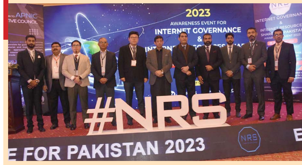
Awareness event for Internet Governance & Internet Resources Share for Pakistan.

ISLAMABAD: Federal Minister for IT and Telecommunication Syed Aminul Haque in a group photo on the occasion of 'Awareness Event for Internet Governance & Internet Resources Share for Pakistan' on Wednesday.