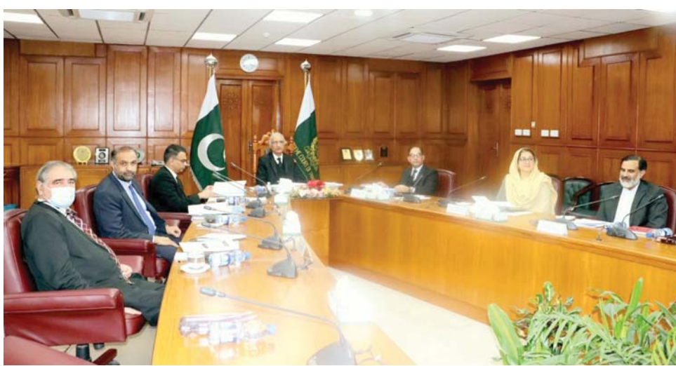
Justice Ijaz ul Ahsan chaired the second meeting of ADR Committee held in the conference room of the Supreme Court Building at Islamabad.