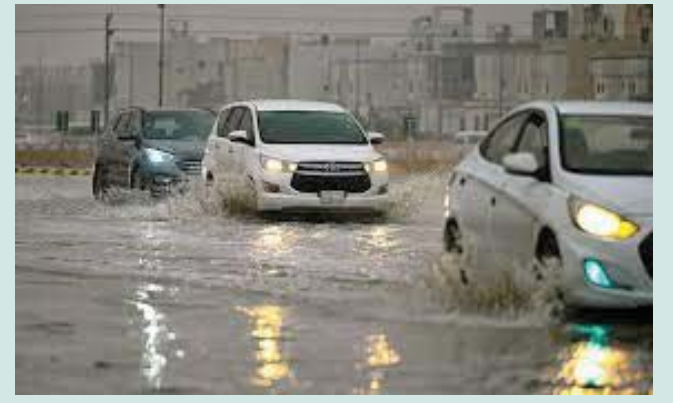
High winds, heavy rain keep Riyadh residents at home.

Pakistan is one of the only two countries — the other being Afghanistan — where polio is still prevalent despite relentless vaccination drives.