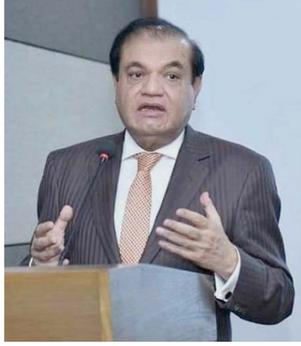
urgently. Gwadar is the second most important port after Karachi and Pakistan's future is linked to it, therefore, the issues of the local popula-

Talking to the business community, the veteran business leader said that Gwadar is very important for the country therefore unrest among the local population should be calmed