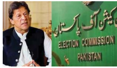
ing his assets.

The ECP said Imran Khan should clarify his position. The notification gave references of the ECP and Supreme Court verdicts. The ECP said the former prime minister was disqualified for misstatement regard-