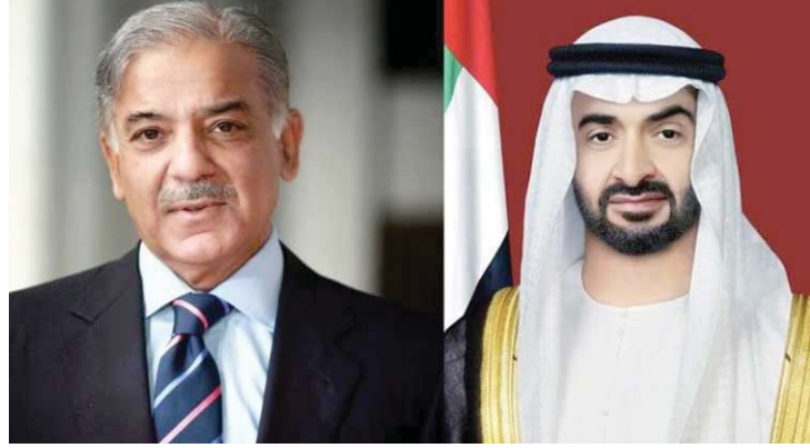
The prime minister briefed him on the upcoming 'International

During a telephonic conversation, the prime minister thanked the UAE president for the financial and material support to Pakistan after the recent devastation caused by climate-induced floods in Pakistan, PM Office Media Wing said statement.