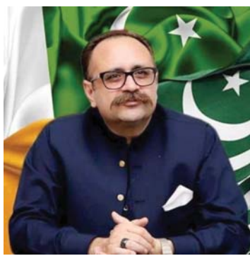
of the state.

He said that in a short period of time the incumbent government took important steps for the welfare and development of the people of the state including increase in the subsistence allowance of post 90 refugees, dowry and Zakat funds given meant for the poor and deserving citizens