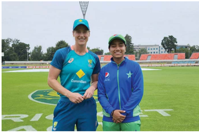
Earlier after the final ODI of the three-match series, Australia Women's Team shared a video on Twitter in which Sana could be seen requesting Jonassen to introduce her to Perry. "Can I talk to Perry?" asked Sana to

Australian veteran admired Sana's dedication towards the game and her bowling besides sharing useful bowling tips with the youngster.