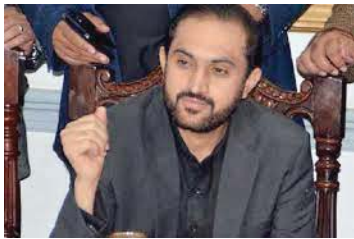
He said that the increase in traf-

Quddus Bizenjo directed the Commissioner Kalat to investigate the causes of the accident and submit a report within 24 hours.