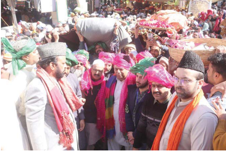
Chargé d'Affaires and representatives of the Zaireen.