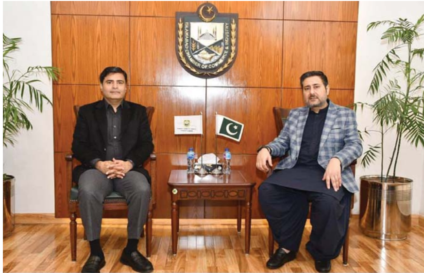
breaking, food & building materials processing, home appliances manufacturing, electronics

Alauddin Marri said that the coastal areas of Balochistan including Gwadar, Turbat and Makran have not been connected with the national grid as yet and added that 100 MW of electricity would soon be supplied to these areas from Iran. He said that Gwadar offers huge business opportunities to both local and foreign Investors in many sectors including service industries, fisheries, petrochemical, tourism, trade logistics, processing and manufacturing industries like assembling of oil storage, refining, transport equipment, ship