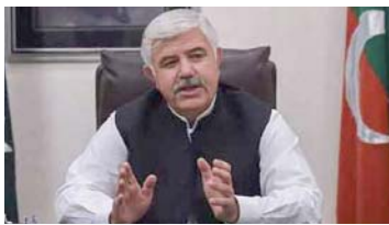
my last address as chief minister". Mr

He revealed the plan while addressing a gathering where he said: "This is