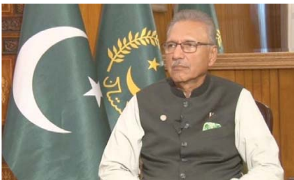
non-receipt of the paper for marking in the examination department, President Secretariat Press Wing said in a press

The student had submitted his paper of Pakistan Studies and its receipt was also acknowledged but he was declared fail on account of the