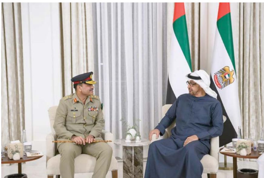
said the statement.

"The two sides reviewed cooperation relations and joint work between the UAE and Pakistan in defence and military affairs, as well as ways to strengthen them to serve the common interests of the two friendly countries,"