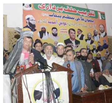
ested in getting power at any cost.

He condemned Pakistan Tehreek-e-Insaf (PTI) Chairman Imran Khan's diatribe against the state institutions, saying that former premier was inter-