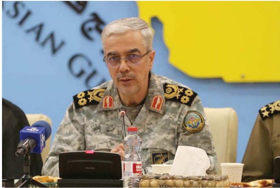
Republic's stance on the issue of Kashmir. Ayatollah Seyyed Ali Khamenei had said "Kashmir is an issue of humanity."

The Pakistani official also appreciated the Islamic