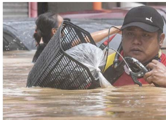
Wednesday in Mati City in the province of Davao Oriental on Mindanao island when a landslide buried four people

Authorities were still searching for more than two dozen other people missing after heavy downpours over the Christmas weekend caused flooding and landslides across central and southern regions. The latest death happened