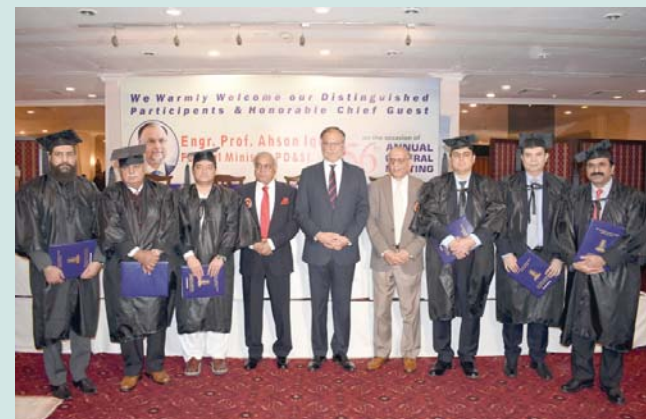
LAHORE: Federal Minister for Planning Development & Special Initiatives Ahsan Iqbal posing for a group photograph along with participants during 56th annual meeting of Engineering Council at a local hotel in Provincial Capital.

This was stated by Sindh Labour and Human Resources Minister, Saeed Ghani while speaking as the Chief Guest at a OSP (Orphan Support Programme) Fun Gala organized by the non-profit Green Crescent Trust (GCT) at Dreamworld Resort for over 1,100 orphan students enrolled in its charitable schools. The orphan students from Karachi, Ghoro and Thatta attended the event.