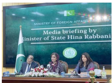
General, which she said was a "clear evidence of India's planned and perpetrated attack against civilians."

She mentioned that Pakistan had submitted the Lahore blast-specific dossier with the United Nations Security Council (UNSC) and would soon be sharing with the UN Secretary