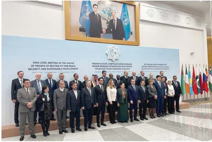
cal equipment as a weapon against patients, which is a "shameful, illegal and inhumane" act. The Iranian official stressed that

In addition, he added, the countries that impose the coercive measures are in fact using medicines and medi-