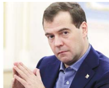
new types of arms including hypersonic weapons that he boasts can circumvent all existing missile defence systems.

President Vladimir Putin repeatedly said that Russia has been developing