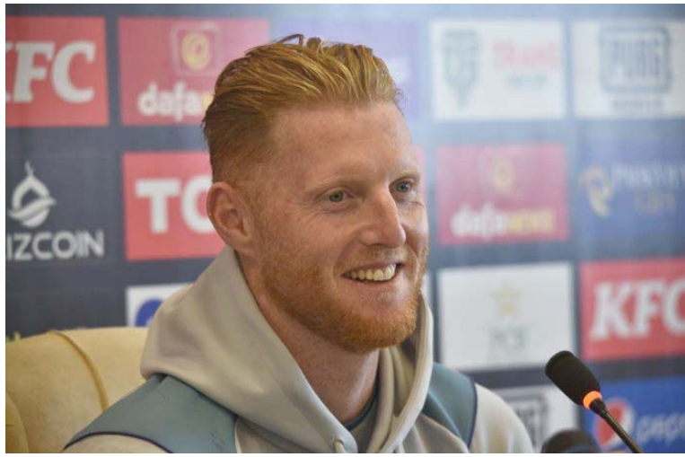
Cricket Stadium was looking dry and it would be helpful for reverse swing and for the spinners too. He said that the defending team was

being expected to fight back as they have the ability to change the situation and also the cricket was an unpredictable game.