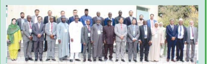
COMSTech Organizes Foundation Meeting of the Alliance of Islamic Universities of Africa

"In the last five years, we have already achieved a lot in the areas of fire protection and electrical safety with our 'Pakistan Building Safety Initiative'. With Accord Pakistan, we can work with many other stakeholders to ensure better standards for textile production." The South Asian country is one of the most important exporters of textiles after Bangladesh. He therefore called on the factory owners, trade unions and retailers involved in the agreement "to put aside their own interests shortly before the goal is reached and to bring about a swift and comprehensive solution for the sake of the thousands of employees".