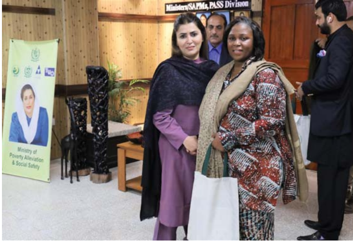
The delegations specifically lauded Nashonuma and Kafaalat programs of BISP which provide vital support to the poorest of the poor.

During the meeting Ms. Shazia Marri informed the delegates about the various social protection initiatives of Pakistan. The members of the delegation appreciated the excellent data collection, bio-metric verification system and efficient payment mechanism of BISP. The delegations specifically lauded Nashonuma and Kafaalat programs of BISP which provide vital support to the poorest of the poor.