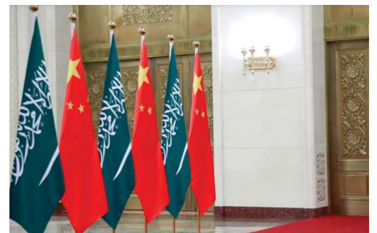
magnificent prospect for the development of China and the Arab countries and bright future of China-Arab states relations, he concluded.