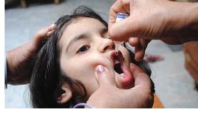
are now critical to success."