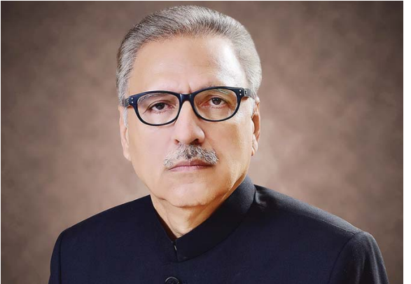
stronger society and healthier country.

In his message on World AIDS Day, he said Pakistan was committed to providing quality health services to all citizens equally without any discrimination or stigmatization with an aim to build a