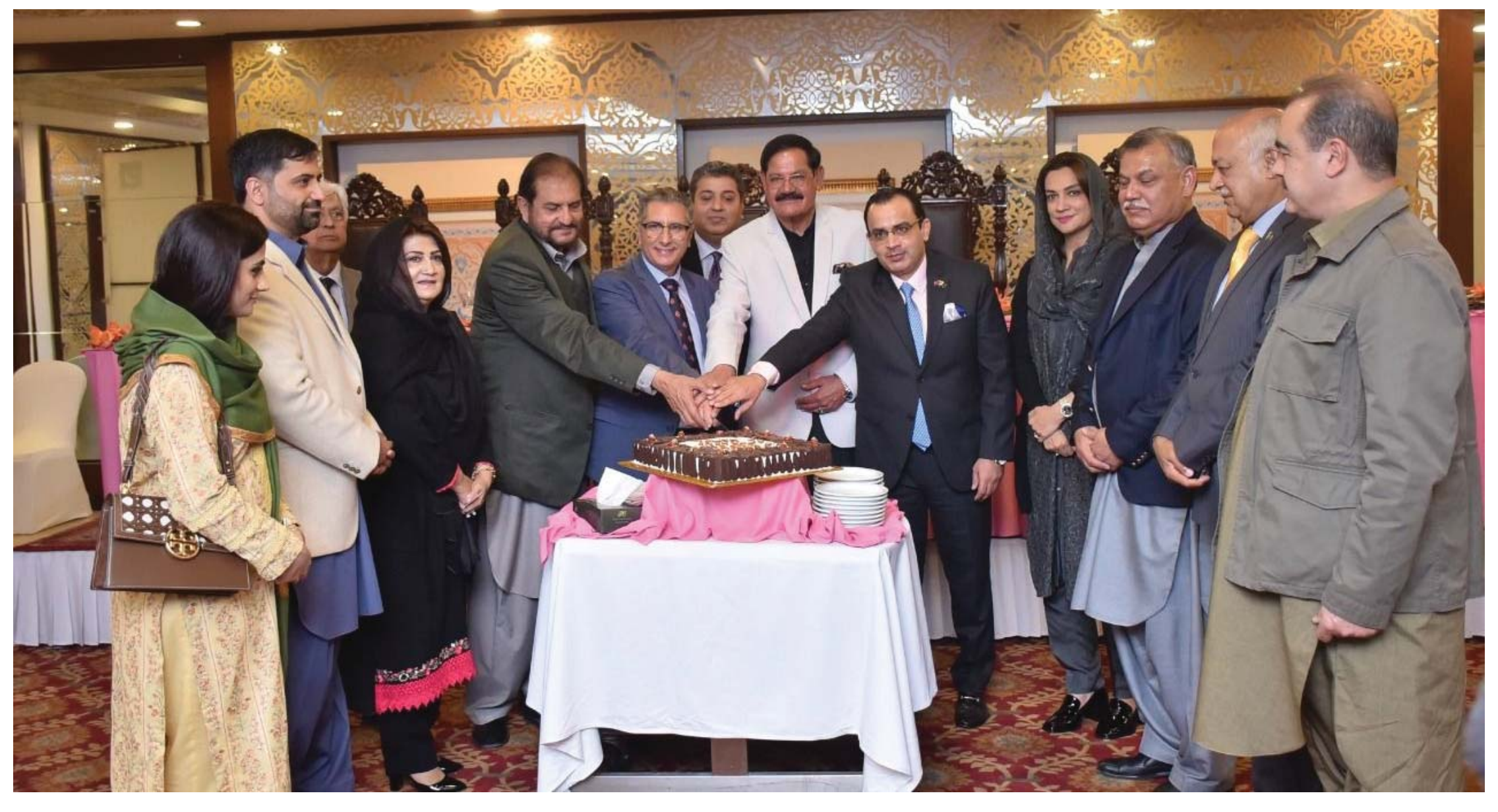
Expansion of diplomatic ties