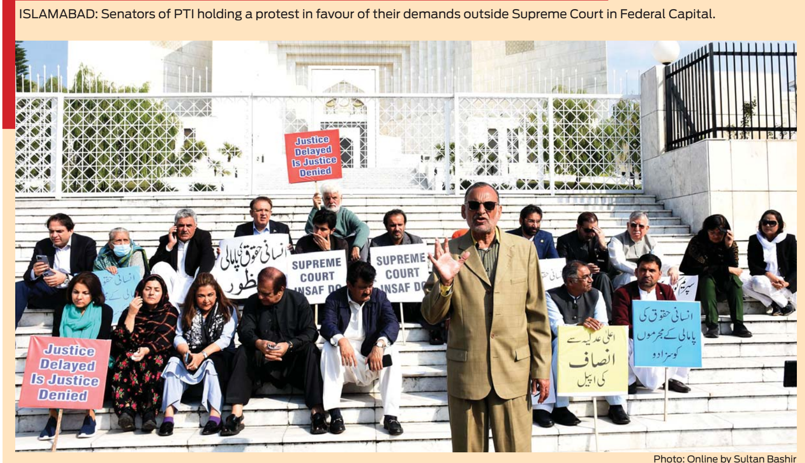
ISLAMABAD: Senators of PTI holding a protest in favour of their demands outside Supreme Court in Federal Capital.