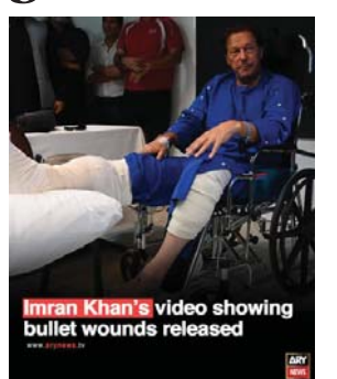
Imran Khan's video showing bullet wounds released

after Minister for Information and PML-N leader Marriyum Aurangzeb said that Imran compromised national interests for personal political gains.