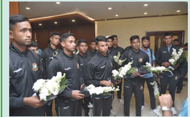
Bangladesh Under-19 cricket team has arrived in Multan. The team will play one 4 days match 3 ODI and Two T-20 matches against Pakistan under-19 cricket team, The four days match begin from 4th to 7th November. One days matches series will start from 10,12 and 14th November while the two T-20 matches will be played on 16th and 18 th November. The entry fee for Spectators will be free.

The concluding ceremony of the tournament will be held on November 12, at 4.30 pm. in which Trophies, Medals and Certificates will be delivered to winning and runner-up teams. APP