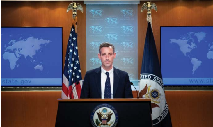
"We said many times now, including truth to these allegations," Price said, adding, "We won't let propaganda, we

"What we can do is counter disinformation, misinformation with information," Spokesperson Ned Price said in response to a question at his daily press briefing from the correspondent of a Pakistani TV channel about the Khan-led March during which the PTI chief was again blaming the US of "regime change" in Pakistan.