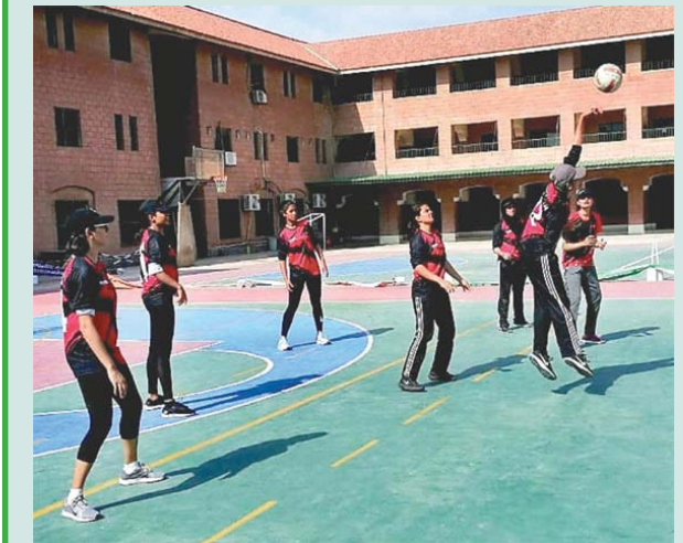
KARACHI :Pakistan Throwball Federation has postponed 11th Culligan Boys and Girls Throwball Tournament due to unavoidable circumstances, which was to play from November 1, at City School, Karachi.