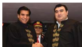
Kashmir issue was essential for the establishment of lasting peace in the region.

Speaker Raja Pervez Ashraf said that the resolution of