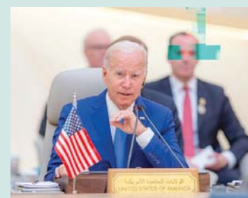
WASHINGTON: The White House has lowered its earlier optimism about the midterm elections and is now worried that Democrats could lose control of both chambers of Congress, administration officials say.

Recent polls have shown Democrats who once had comfortable leads in some Senate races on a knife's edge, and Senate elections that were considered toss-ups between the two parties now leaning Republican as high inflation persists.