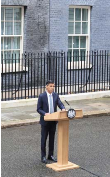
"I will place economic stability and confidence at the heart of this government's agenda," he said. "This will mean

Sunak said he had been elected prime minister to "fix" those mistakes.