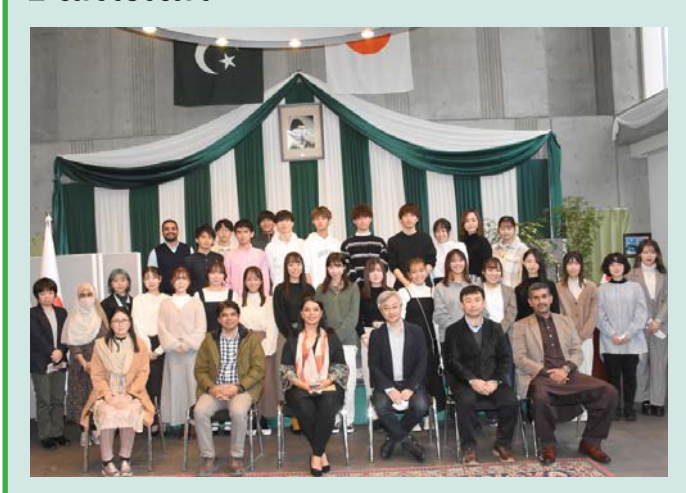
😂 Spokesman Report

TOKYO: A group \ of \ students \ from \ Tokyo \ University \ of \ Foreign \ Studies along with faculty Professors of Urdu Department visited the Embassy of Pakistan, Tokyo on Tuesday.