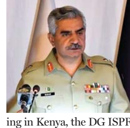
said: "It is very unfortunate

the accusations being hurled at the institutions' alleged involvement in Sharif's kill- the DG ISPR said.