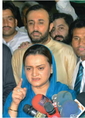
condoled the tragic death. The mother of Arshad Sharif

She said Prime Minister was grieved over the untimely death and he, in a telephonic conversation with mother of Arshad,