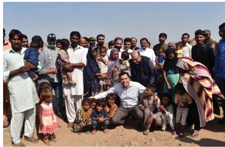
FAISALABAD: The group photo of The Deputy Commissioner along with children after inaugurating the next Anti-polio campaign.

He said that he would positively check performance of polio teams by visiting different areas of the district and strict action would be taken against negligent, lethargic and delinquent elements.