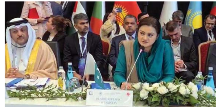
Muslim minorities across the globe.

As a representative of the collective aspirations of the Muslim Ummah, she stressed, the OIC was uniquely poised to lead the endeavour, and must throw its full political and economic weight and clout in protecting the fundamental rights of Muslims and interests of