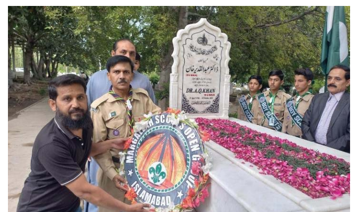
Islamabad: Boys Scouts lay floral wreath on grave of National Hero Dr Abdul Qadeer Khan.