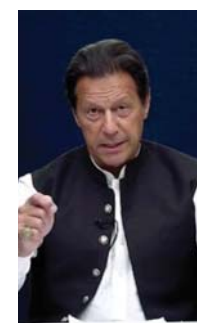
hands of others.

He accused the Election Commission of Pakistan, which heard and decided on a reference filed against him by six lawmakers in the national assembly, as becoming part of the conspir-