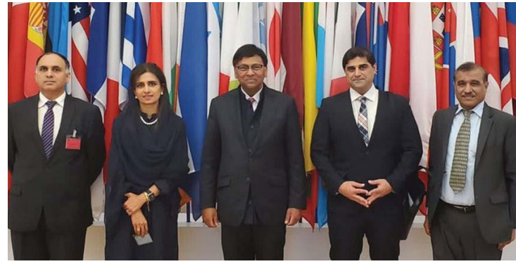
PARIS: Minister of State for Foreign Affairs Hina Rabbani Khar holds meeting with FATF President T. Raja Kumar on the sidelines of FATF ICRG/Plenary meetings in Paris and discusses Pakistan's constructive engagement with FATF and international community.

Meanwhile, in a news conference in Paris on Friday, Minister of State for Foreign Affairs Hina Rabbani Khar has said FATF has unanimously decided to remove Pakistan from the "list of jurisdictions under increased monitoring and now it has been whitelisted by FATF. She said FATF has welcomed Pakistan's significant progress in improving our Anti-Money Laundering and Countering Financing of