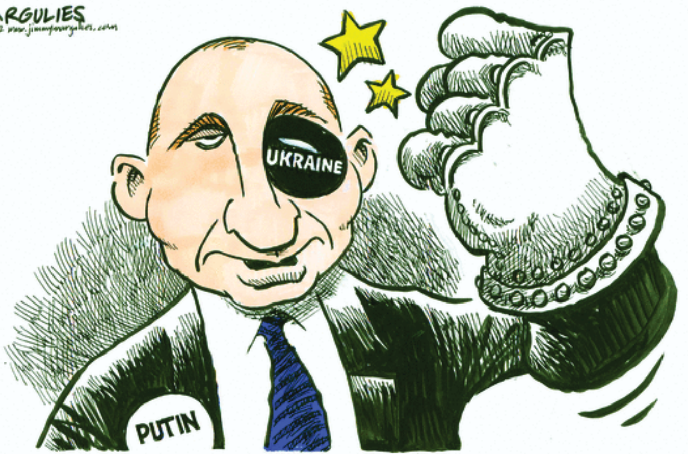
"The situation demands I rule with an iron fist..."