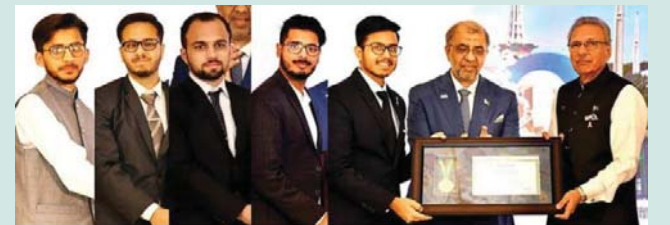
President Dr. Arif Alvi giving away gold medals and merit certificates to top performing graduates of the Institute of Chartered Accountants of Pakistan (ICAP) at Aiwan-e-Sadr.

This changed whole working environment of the institution in a very positive manner. He worked on the digitization of the organization and introduced the digitized process of attestation & equivalence thus setting the organization on modern pathways. In addition to this, he introduced the E-Office system at IBCC secretariat to ensure efficiency, transparency, and accountability while making the environment paperless and reducing the chances of human errors.