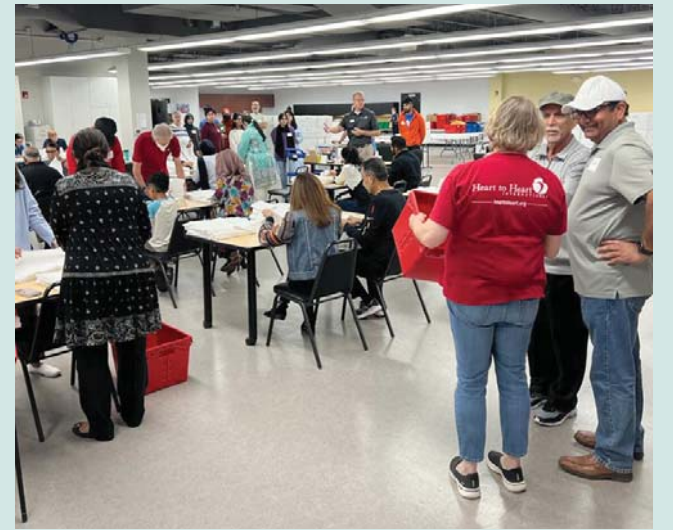
KANSAS: Over 100 USA citizens volunteers work together to prepare hygiene kits for Pakistani flood victims.

Ukraine's military said it had destroyed 37 Russian drones since Sunday evening, or around 85% of those used in attacks. Elsewhere, Russian shelling near the Zaporizhzhia nuclear plant, Europe's largest, caused it to be disconnected again from Ukraine's power grid, Ukrainian state energy firm Energoatom said.