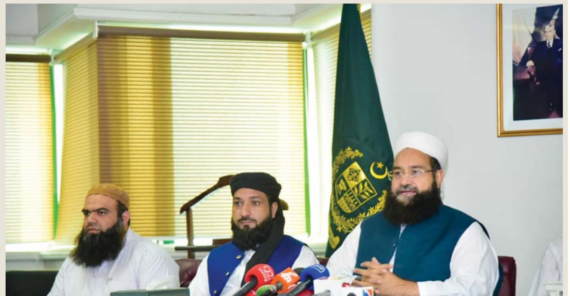
Special Representative to the Prime Minister on Interfaith Harmony and Middle East and Chairman Pakistan Ulema Council Hafiz Tahir Mahmood Ashrafi addressing press conference in Islamabad on Saturday.

Criticizing India for imposing restrictions on the Eid Milad-un-Nabi Peace Be Upon Him's processions across the country and occupied Kashmir, he urged the international organizations to stop the Indian government to usurp the basic human and religious rights of Muslim and as well as other minority communities.