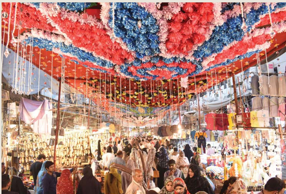
LAHORE: An illuminated view of Baghbanpura Bazar in Provincial Capital, decorated with artificial flowers and colorful lights ahead of Eid Milad-un-Nabi (SAW) celebrates on 12th Rabi-ul-Awal, the birth anniversary of Muslim's beloved Prophet Muhammad (PBUH).

As an epitome of piety, righteousness, tolerance and harmony, the Holy Prophet conveyed the message of Allah and Islam across Arabian peninsula and beyond to bring about real changes in the lives of ignorant, idol worshippers and cruel segments of the society.