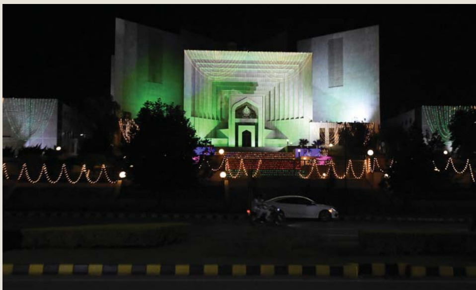
ISLAMABAD: An illuminated view of Supreme Court in Federal Capital decorated with colorful lights ahead of Eid Milad-un-Nabi (SAW) celebrates on 12th Rabi-ul-Awal, the birth anniversary of Muslim's beloved Prophet Muhammad (PBUH).

Special events and programs are planned to highlight 'Uswa-e-Husna' of the Holy Prophet as public and private buildings, mosques, streets and houses are illuminated and processions are taken out to manifest love and commitment with the greatest leader of the universe.