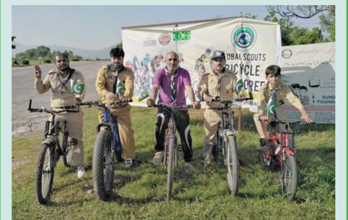
Entry Gate Mehran Gate F-9 Park 8th October large number of students from different schools and colleges participated.