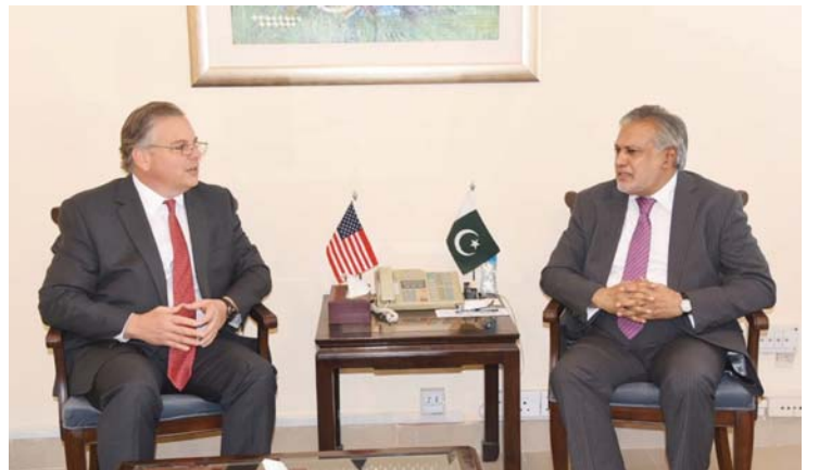
Islamabad: Ambassador of the United States of America to Pakistan, Donald Blome called on Federal Minister for Finance and Revenue Senator Mohammad Ishaq Dar at Finance Division on Friday.

ISLAMABAD: Federal Minister for Finance and Revenue, Mohammad Ishaq Dar said here on Friday that attracting the United States foreign investment in different sectors of Pakistan's economy was the government's top priority. During a meeting with Ambassador of the United States of America to Pakistan, Donald Blome, who call on the minister here, Ishaq Dar said the incumbent government was focusing on creating a business-friendly environment for foreign investors. He highlighted the importance of long-term, broad-based and multi-dimensional relationship between Pakistan and the United States, according to press statement issued by finance ministry. The minister briefed the Ambassador about devastations caused by the recent floods in Pakistan, the statement added. The Finance Minister further highlighted the economic agenda and policies of the government with aim to bring about economic and fiscal stability. He reiterated the desire of the present government to further deepen bilateral trade and investment ties with the USA. On the occasion, the ambassador felicitated the Finance Minister on