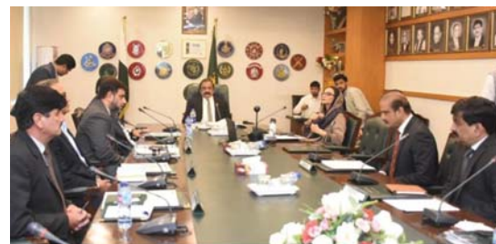
Islamabad: Federal Minister for interior Rana Sana Ullah Khan chairing the 1st meeting of the High Powered Committee constituted by Prime Minister on Cyber Security Breach in public offices, Islamabad on Friday.

ISLAMABAD: Minister for Interior Rana Sanaullah on Friday said that PTI Senator Saifullah Sarwar Khan Nyazee had been taken into protective custody in the foreign funding case. Addressing a press conference, he said that Senator Saifullah Nyazee had not been appearing for investigation in foreign funding case and now he had been taken into protective custody so that he could be formally questioned. He said legal procedure would be followed for the arrest of PTI Senator if required at a later stage. He said that PTI member Hamid Zaman had been also taken into protective custody in this foreign funding case. Minister for Interior said that Imran Khan was misleading the nation and his narrative of conspiracy had been exposed. He said nation should understand the reality of Imran Khan and identify this 'fitna'. Commenting on recent audio leak of Imran Khan, he said the leaked audio reveals that he was involved in horse-trading.