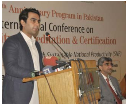
International Conference on Productivity Accreditation and Certification in Pakistan.

He expressed these views while addressing an opening ceremony of International Confer-