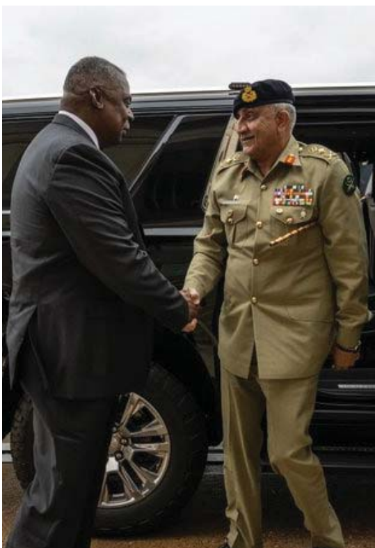
Secretary of Defence General Lloyd James Austin III (Retired) receives Chief of Army Staff, General Qamar Javed Bajwa at the Pentagon.

He said Pakistan fully understands the loss and