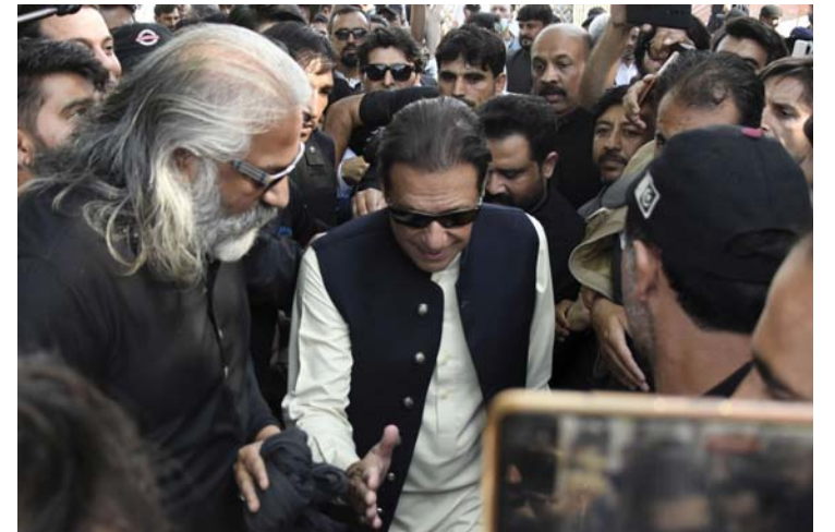
ISLAMABAD: Former Prime Minister and Chairman Pakistan Tehreek-e-Insaf Imran Khan leaving Islamabad High Court after attend his hearing for contempt case in IHC, in Federal Capital.

After the proceedings, Imran Khan had an informal conversation inside the courtroom with the media. When a journalist asked Imran Khan about his strong networking skills, he replied, "A politician talks to everyone but will