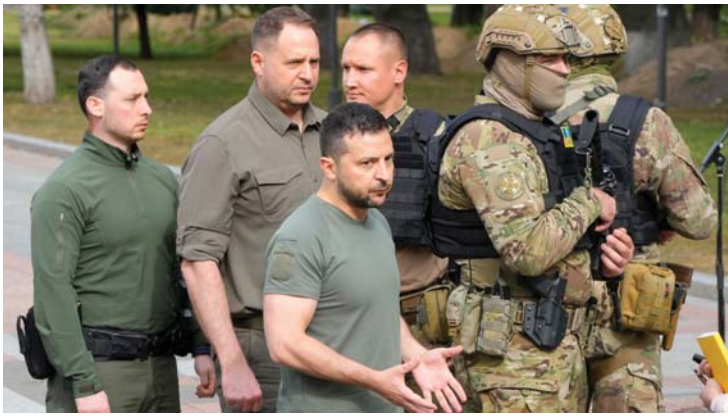
began last month.

Kherson is one of the four regions illegally annexed by Moscow last week after a hasty "referendum" orchestrated by the Kremlin that Western nations have derided as a sham vote at gunpoint. Kherson has been one of the toughest battlefields for the Ukrainians, with slower progress when compared with Ukraine's breakout offensive in the northeast around the country's second-largest city of Kharkiv that