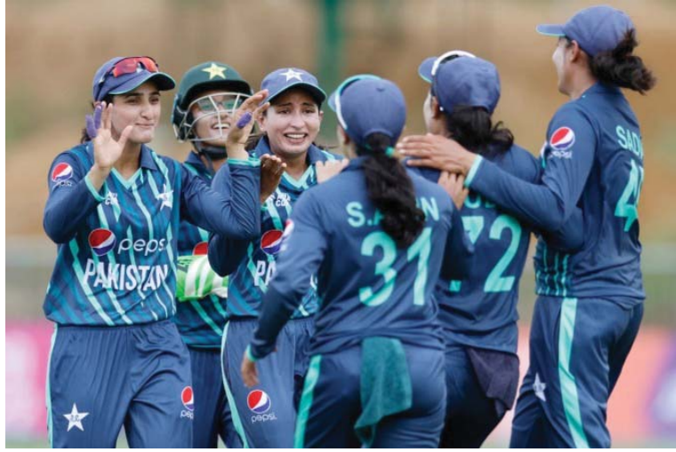
play, Nida Dar (4-0-19-2), Omaima Sohai (1-0-4-1) and Sadia Iqbal (4-1-

Pakistan's Bismah Maroof decision to bowl first after winning the toss paid dividends in the first over like yesterday's match as right-arm fast Diana Baig dismissed Shamima Sultana for one. Spinners once again came into