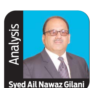
st October 2022 is

the People's Republic omies. of China. While greetings the leadership and Peoples of China, it is be fitting to look on the seven plus decades journey of rising and shining China.