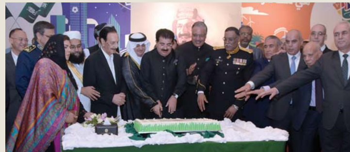
ISLAMABAD: Chairman Senate, Muhammad Sadiq Sanjrani, Ambassador of the Kingdom of the Saudi Arabia to Pakistan Nawaf Saeed Al-Malkiy and others cutting cake during celebration of the 92 National Day of the Kingdom of the Saudi Arabia at a Local Hotel, in Federal Capital.

"Saudi Arabia is moving ahead of time when it comes to progress, prosperity and welfare of its people under the visionary and farsighted leadership of the Kingdom," the Speaker remarked.