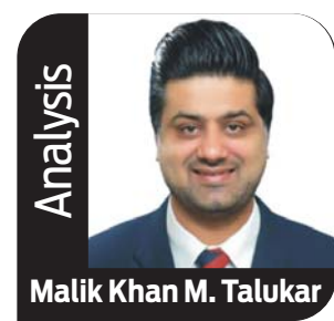
Analysis Malik Khan M. Talukar

The incumbent government of Pakistan has geared-up its "economic diplomacy" and tried to "diversify" its sources of seeking inflows of Foreign Direct Investment (FDI). Current account deficit is widening. Foreign reserves are at the lowest ebbs.