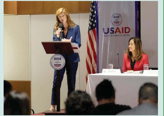
COLOMBO: A visiting U.S. diplomat on Sunday urged Sri Lankan authorities to tackle corruption and introduce governance reforms alongside efforts to uplift the country's economy as a way out of its worst crisis in recent memory.

USAID Administrator Samantha Power told reporters that such moves will increase international and local trust in the government's intentions.