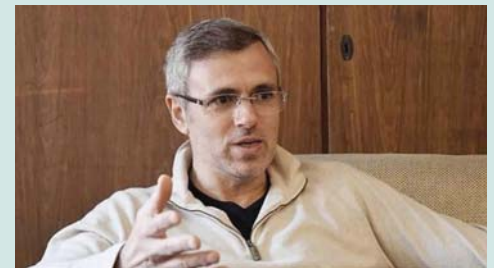
SRINAGAR: In Indian illegally occupied Jammu and Kashmir, the National Conference vice president, Omar Abdullah, has said that his party

will continue fighting democratically, constitutionally and politically for restoration of Article 370, which was abrogated by the Indian government three years ago