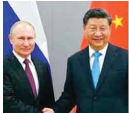
Uzbekistan, Kazakhstan and the Kremlin said.

China's president will then meet Putin at the Shanghai Cooperation Organization's summit in the ancient Silk Road city of Samarkand in