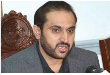
and immunization program will be ensured in the affected areas", he

He directed to the Secretary Health that a special vaccination campaign to prevent epidemic diseases should be started immediately in the flooded areas. "Effective implementation of maternal and newborn health