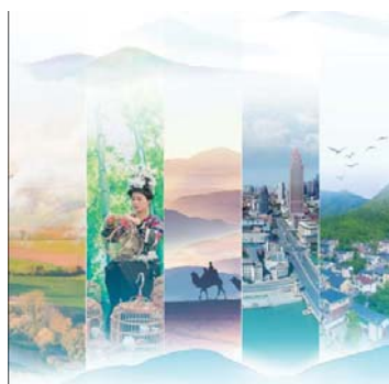
Center and Overseas China National Tourism Office.

2022 China Tourism and Culture Week is jointly hosted by Bureau of International Exchange and Cooperation, Department of Intangible Cultural Heritage, Ministry of Culture and Tourism and People's Daily Online, and organized by Overseas China Cultural