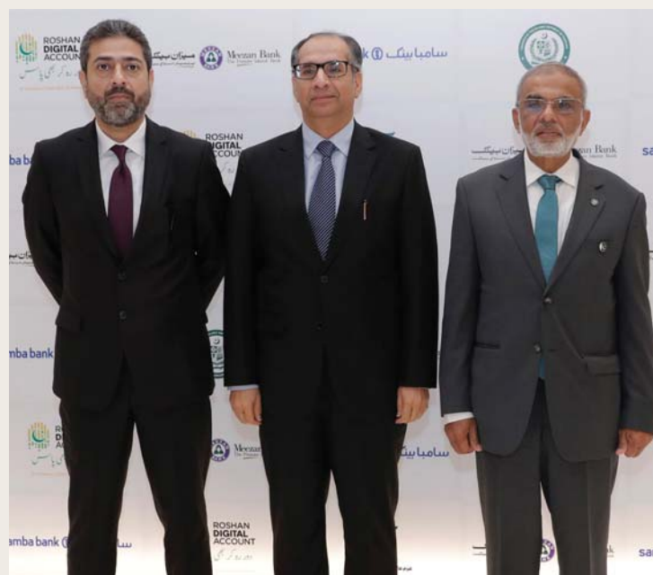
ing the event and said, "Alhamdulillah, Meezan Bank is the only bank to have received One Billion USD in remittances under the Roshan Digital Account