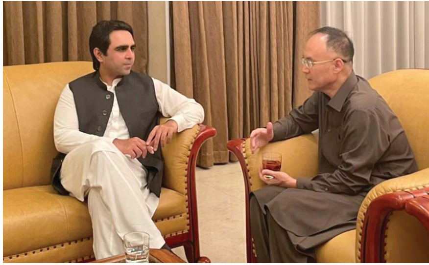
long term policies and exchange ideas with regard to exporting zones. He said, currently

For export promotion, the minister said both the countries could work together on