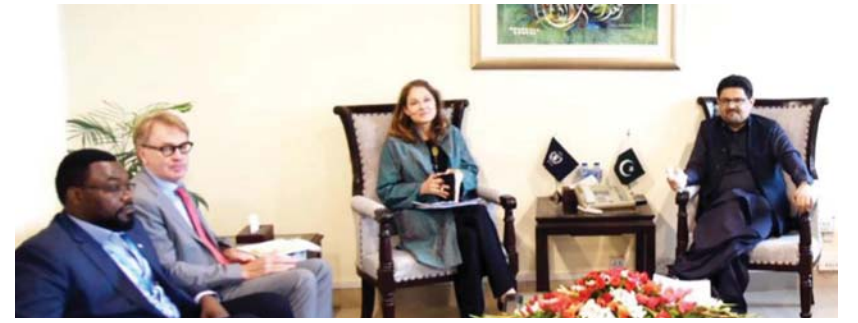
Princess of Jordan H.R.H. Sarah Zeid Raad-World Food Programme (WFP), Special Advisor on Maternal & Child Health and Nutrition called on Federal Minister for Finance and Revenue, Mr. Miftah Ismail at Finance Division, Islamabad on Thursday.

"Qatar would make investments in the freight cargo terminal of Port Qasim. Doha is also willing to make investments in shares of the stock market. Moreover, Qatar is mulling over giving employment to 200,000 Pakistanis," said Miftah Ismail. Finance Minister for Finance and Revenue Miftah Ismail on