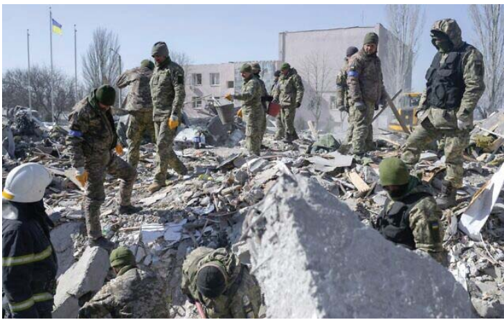
Ukraine's armed forces or other services.

Zaluzhnyi provided no details and did not say whether the figure he cited included all service personnel killed in action, such as border guards. President Volodymyr Zelenskyy told the conference that about 1 million people were defending Ukraine as part of