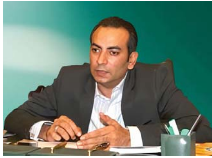
employment for them.