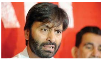
all cases through video conferencing. However, the court offered him legal aid.

NEW DELHI/SRINAGAR: Jammu and Kashmir Liberation Front Chairman, Muhammad Yasin Malik has once again demanded physical appearance during the hearing in a case registered against him in a Jammu court about the killing four Indian Air Force (IAF) personnel in 1990. Malik appeared in the hearing via video conference from Delhi's Tihar Jail where he is currently lodged.