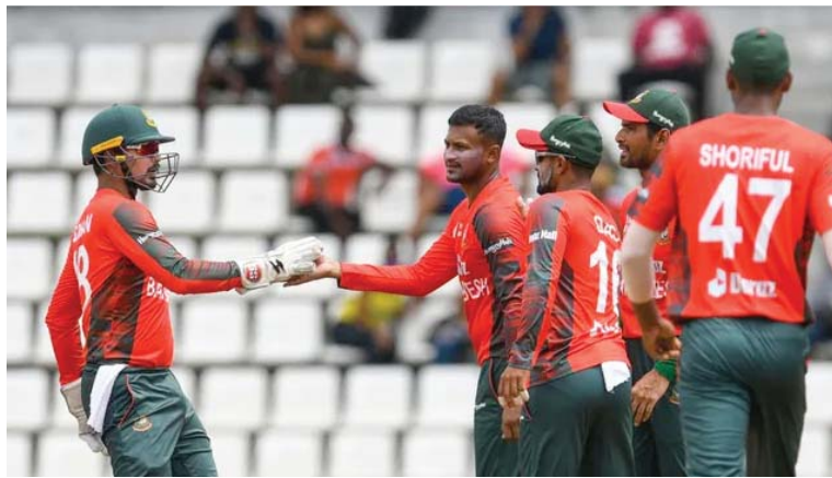
for the T20 Asia Cup. Litton Das was the most notable omission with injury ruling him out of the tournament. But the squad will be boosted with the return of several key players including captain Shakib, Mushfiqur Rahim, Sabbir Rahman, Ebadot Hossain and Mohammad Saifuddin. Squad: Shakib Al Hasan (c), Anamul Haque, Mushfiqur Rahim, Afif Hossain,

DHAKA: Bangladesh named a 17-member squad for the Asia Cup starting later this month while also announcing their captain for the tournament as well as the T20 World Cup later this year. Shakib Al Hasan returns as the captain of the Bangladesh T20 side and has been named the skipper at least until the T20 World Cup later this year. His first assignment in his fresh stint as captain begins with the Asia Cup, starting on 27 August. Nurul Hasan was named the captain for the recent tour of Zimbabwe after Mahmud Ullah was removed as captain due to lack of results. However, Shakib Al Hasan – who was already named the Test skipper after Mominul Haque stepped down – is set to take the reins of the team for the upcoming Asia Cup, the tri-series in New Zealand that also involves Pakistan and the T20 World Cup. Bangladesh also named the squad