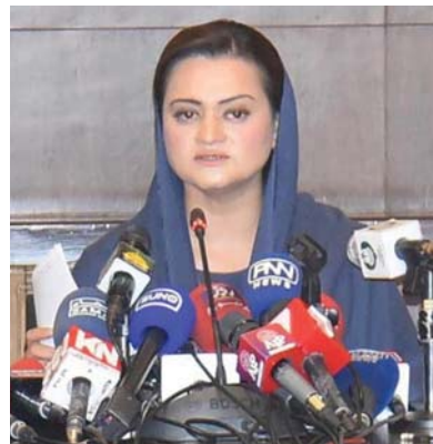
She said Imran Khan had laundered billions of dollars by receiving foreign