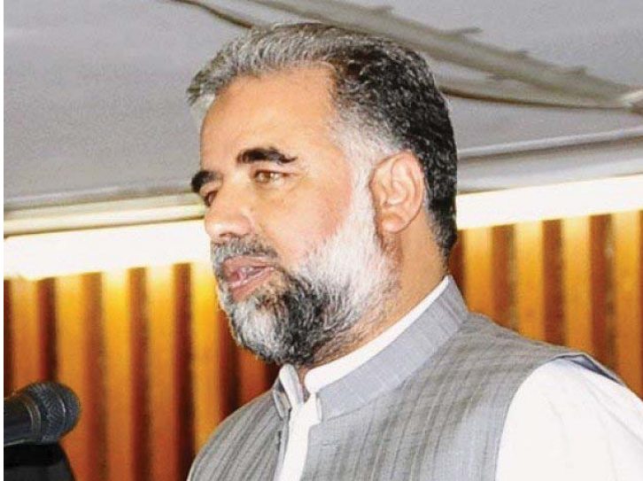
the assembly and Imran Khan lost his government, he added.