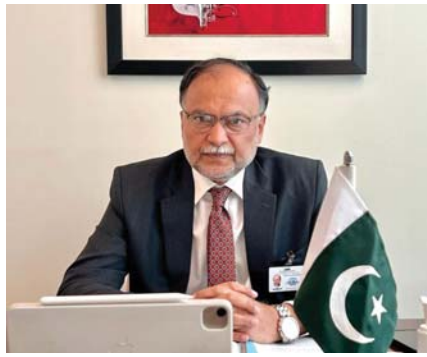
The minister said the countries like Pakistan were now under heavy pressure of these increased commodity prices which also resulted in creating financial burden on private sector.

The event was organised by UN Global Compact (UNGC).