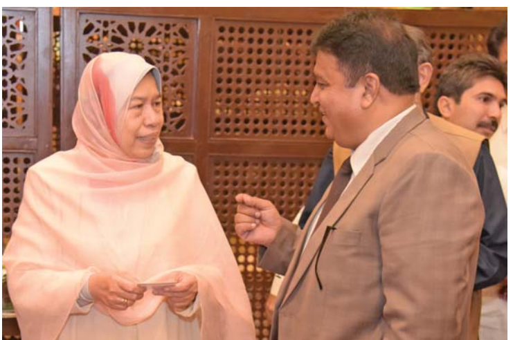
Minister of Plantation Industries and Commodities of Malaysia, Zuraida Kamaruddin discusses about MIACES 2022 with Naveed Ahmad Khan Managing Editor, Daily The Spokesman.

connects industry players with innovative solutions, contributing towards achieving the Sustainable Development Goals (SDGs), especially as the world faces a changing climate. Through the MIACES roundtable