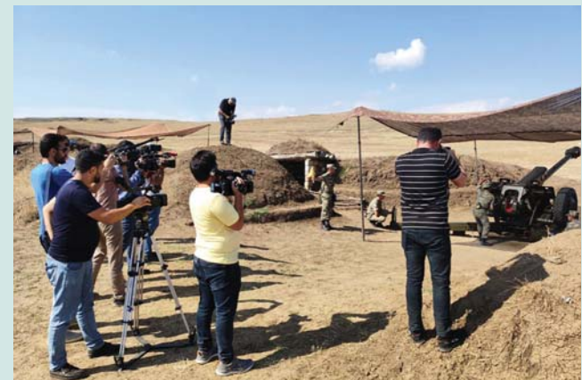
BAKU: Azerbaijan's Ministry of Defense has organized a tour for media representatives on the occasion of the anniversary of Tovuz battles, the Ministry of Defense told AZERTAC.

"Media representatives filmed and interviewed servicemen serving in the military unit deployed in this area, as well as participants of the Tovuz battles.