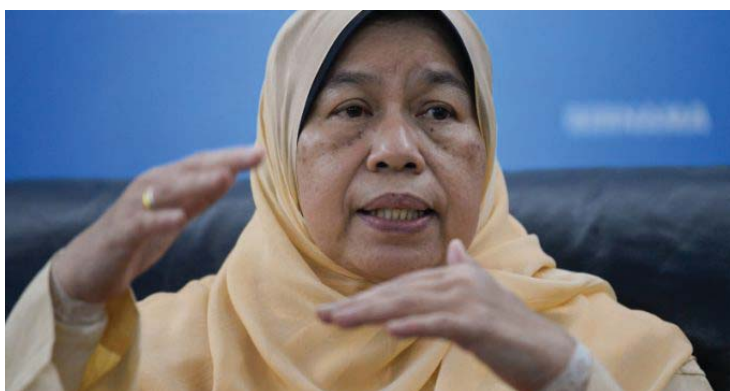
Minister of Plantation Industries and Commodities of Malaysia, Datuk Zuraida Kamaruddin

Happening at the Malaysia International Trade and Exhibition Centre (MITEC) from 26 to 28 July, MIACES showcases an exhibition of in-demand commodity products, services,