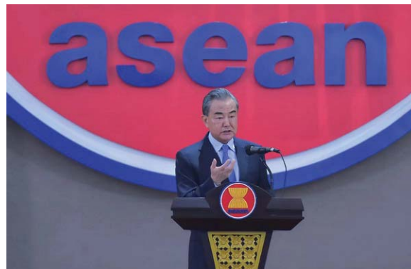
Secretary-General of ASEAN, Dato Lim Jock Hoi, met with State Councillor and Foreign Minister of the People's Republic of China, H.E. Wang Yi, at the ASEAN Secretariat on 11 July 2022. During his visit to the Secretariat, the State Councillor also delivered a Policy Speech touching upon ASEAN-China relations and open regionalism.

First, continue to support ASEAN Centrality and promote solidarity and cooperation