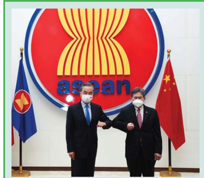
Secretary-General of ASEAN, Dato Lim Jock Hoi, met with State Councillor and Foreign Minister of the People's Republic of China, H.E. Wang Yi, at the ASEAN Secretariat on 11 July 2022. During his visit to the Secretariat, the State Councillor also delivered a Policy Speech touching upon ASEAN-China relations and open regionalism.

"Russian forces are likely maintaining military pressure on Ukrainian forces whilst regrouping and reconstituting for further offensives in the near future," the intelligence briefing