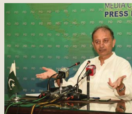
the tenure of PTI government.

"Under the new law, whatsoever the price is proposed by OGRA, it would be the prescribed rate in the country after 40 days [of submitting the proposal]," he said, adding all the documentation, public hearings on petitions of Sui Northern Gas Pipelines Limited (SNGPL) and Sui Southern Gas Company (SSGC) to determine the gas price for fiscal year 2022-23 by OGRA, and other related correspondence had been completed in the November last during